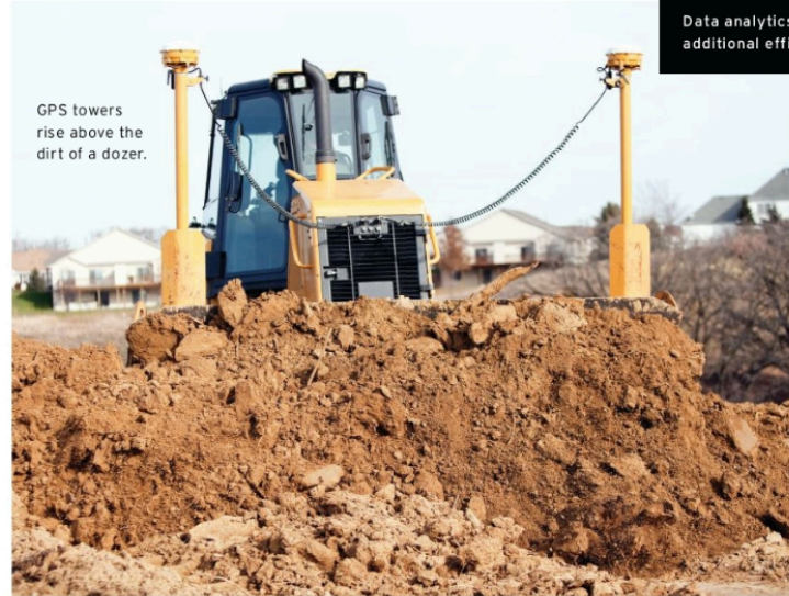
GPS towers rise above the dirt of a dozer.

look. As small and mid-sized contractors use GPS technology for jobs like sports fields, running tracks, housing subdivisions, ponds, house pads, or parking lots, machine control is the new way of the world. Contractors and system manufacturers are finding new applications that would have been restricted to science fiction only a decade ago.